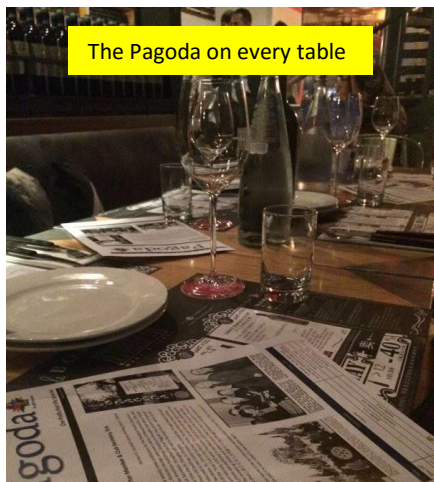
The Pagoda on every table