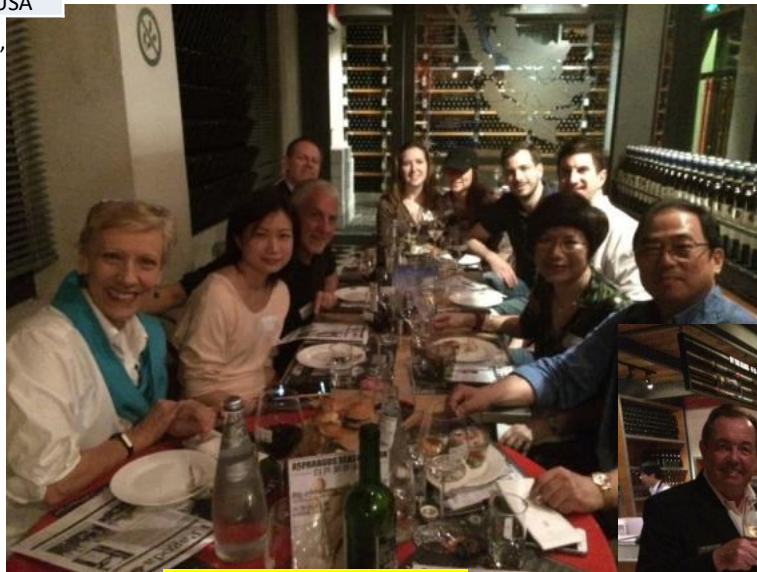
Obviously both tables were happy